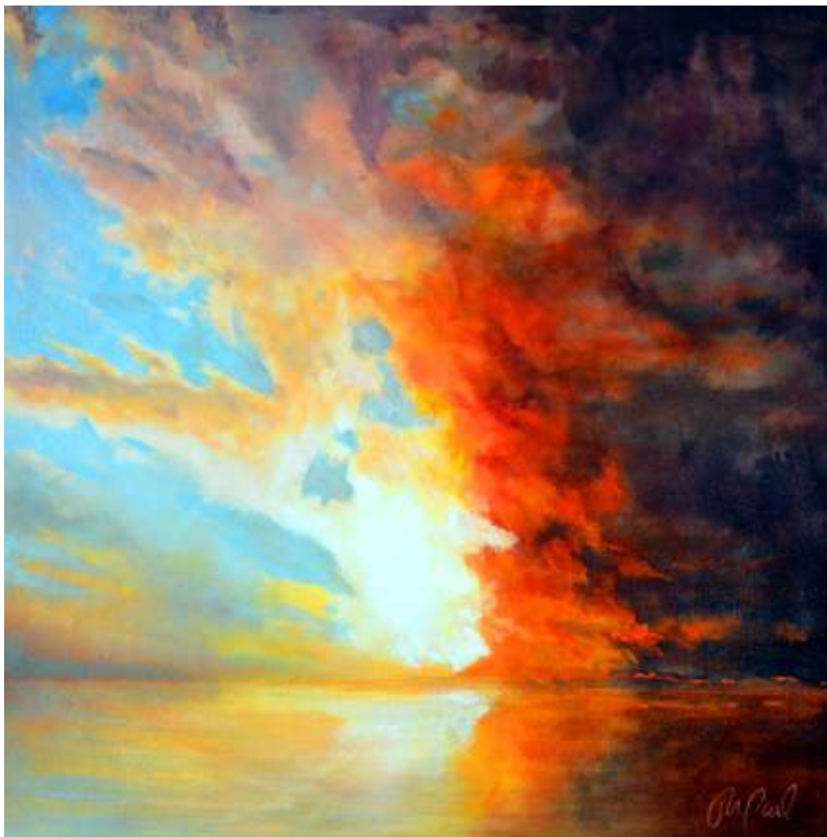
Day & Night