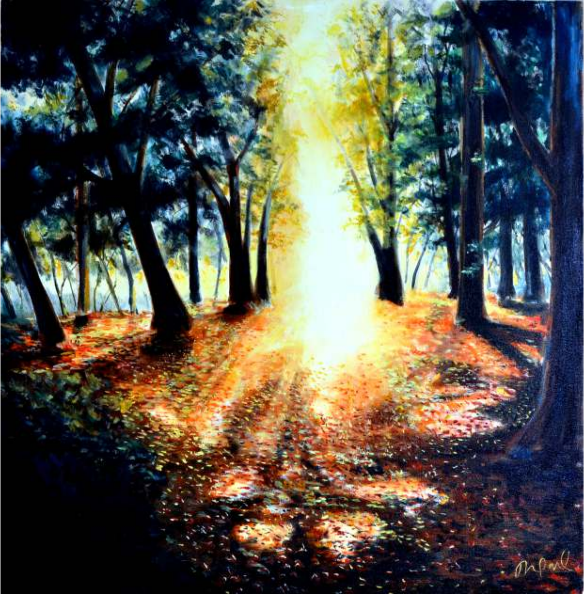
Horse Pasture Wood Sunrise