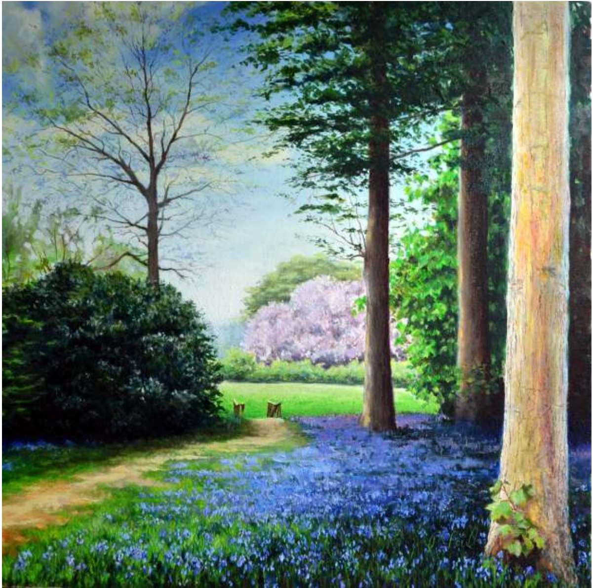
Spring in the Woods