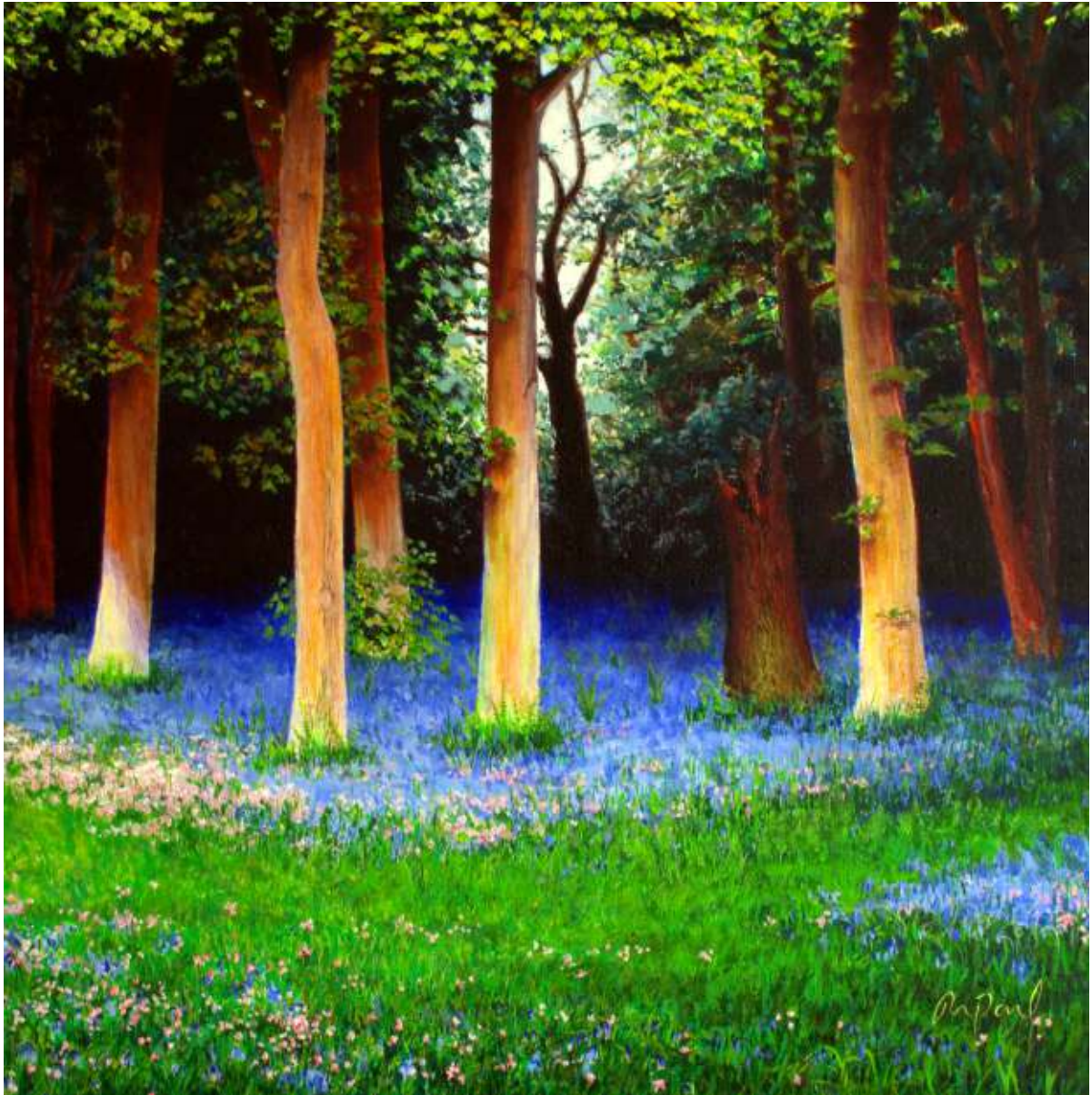
Spring Woodland Walk