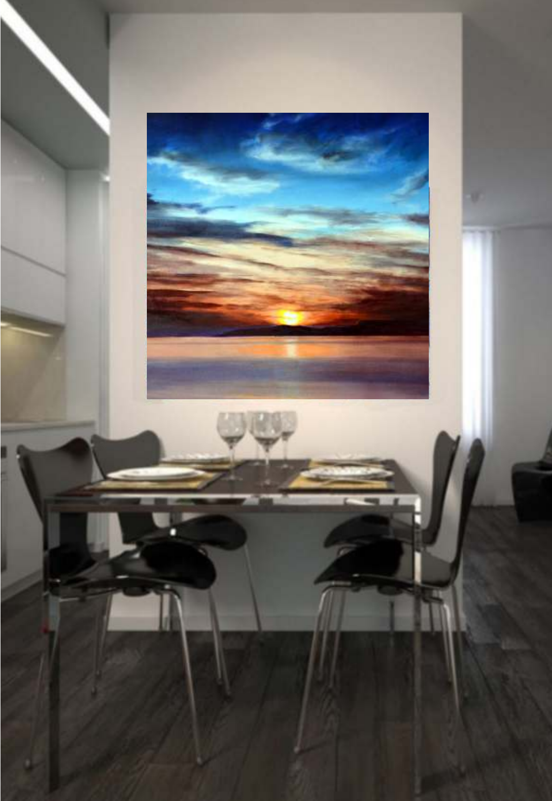
'New Dawn', the cover image in situ.