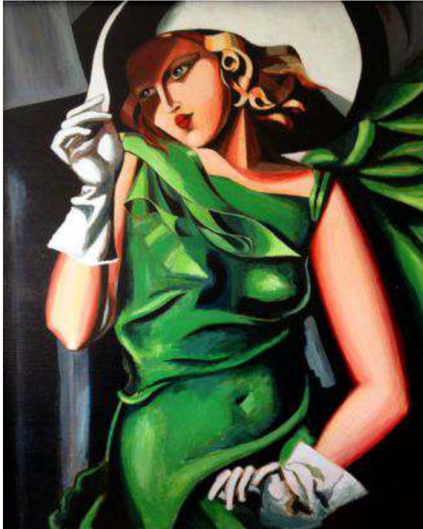
Tamara De Lempicka